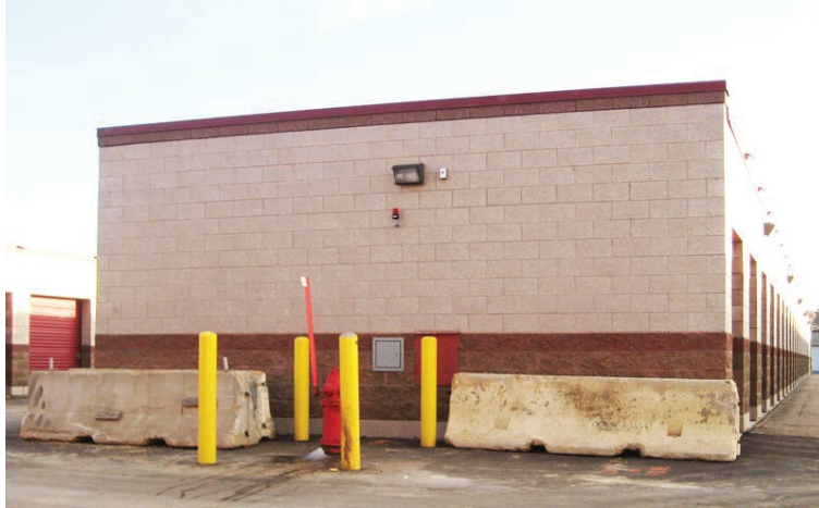
Completed Wall Repair